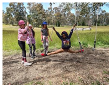
Low ropes course