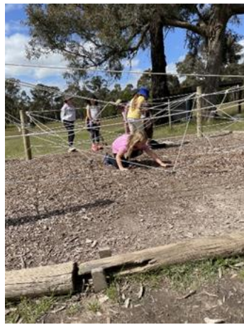
Team Building Challenge