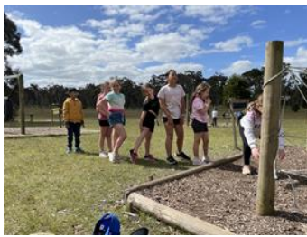
Team Building Challenge

The grade 3 and 4 students were given an opportunity to attend school camp at Campaspe Downs from 30th November to 1st December 2022. School camp has many benefits in providing outdoor education to students. It gives them the opportunity to make new friends, foster independence, build confidence and have fun! Here are a few pictures to show some of what we got up to, and the fun that we had.