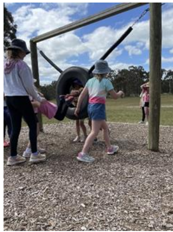
Team Building Challenge